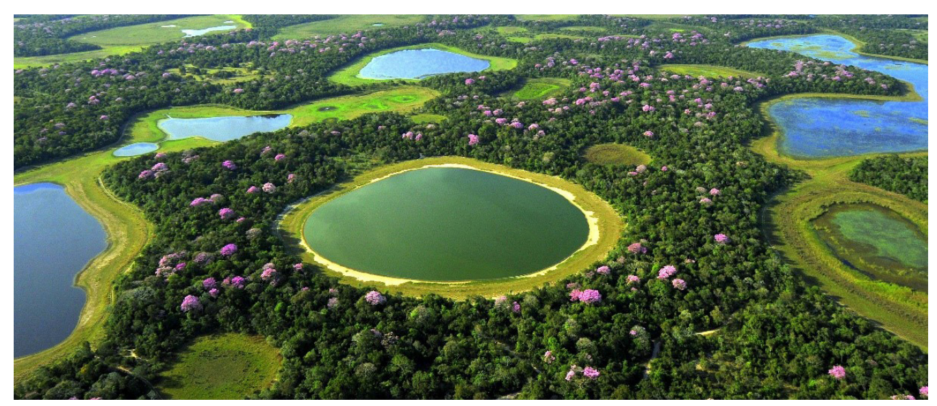
The Pantanal is a gigantic, seasonal floodplain in south-central Brazil that provides sanctuary for a rich assortment of wildlife, consisting of thousands of varieties of butterflies, hundreds of species of fishes, roughly 600 species of birds, and many mammals and reptiles. The region is also home to a number of endangered or increasingly rare animals and is one of Brazil's biggest sources of beef.