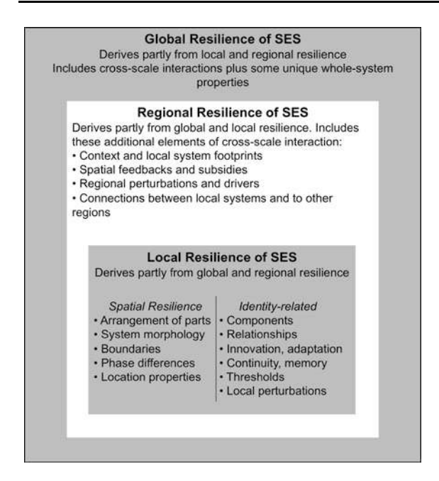
Fig. 1 Conceptual summary of hierarchical influences on the spatial resilience of a SES. The local resilience of a SES both influences and is influenced by its global, regional and internal resilience. Spatial variation and relationships are important at each of these scales. Reproduced with permission from Cumming (2011)

influences on identity. As argued by Cumming et al. (2005), a focus on identity and identity-related thresholds (i.e., points beyond which the identity of the system is lost) provides a way of linking tangible management goals and resilience theory. For example, the manager of a protected area in Zimbabwe might take the essential ecological elements of the system to include the maintenance of canopy cover and a set of processes that relate to pollination, seed dispersal, and woody plant recruitment. Management