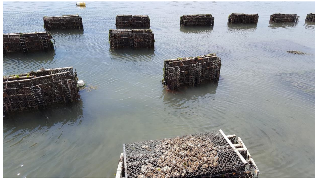
Oyster farm in NH, racks lifted for cleaning.

World Bank. (2013). FISH TO 2030- Prospects for Fisheries and Aquaculture. WORLD BANK REPORT NUMBER 83177-GLB. 70 pp. <u>http://www.fao.org/docrep/019/i3640e/i3640e.pdf</u>.